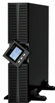
Display panel can be rotated